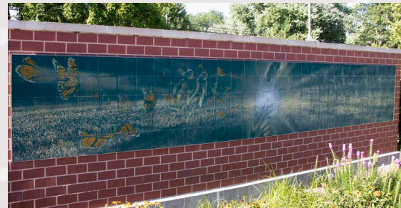
Created by Boston artist, Rufus Butler Seder

The Lifetile wall was created via a heat process, the only one of its kind in the State of Nebraska. The art is infused into the back of glass bricks, creating a holographic movement as visitors walk in front of the mural. A young boy and girl run through a meadow of butterflies to the center of the wall. When they meet in the middle a burst of light occurs as a large hand descends from above and grasps a small hand in the middle of the light. Interpretation of the mural is left to the observer.